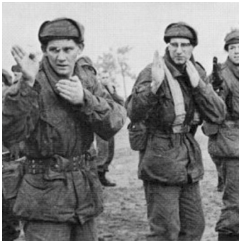
Recruits put through the process during WWII.

Small groups of lightly armed men who ventured out behind enemy lines for the purpose of recon, probing, intelligence, prisoner grabs, and psychological demoralization missions. The nature of fighting under these conditions became popularized as trench warfare. This was close-in, knife to belly, hand to hand combat. For this all manner of expedient, purpose designed and improvised close-combat weaponry was developed and deployed.