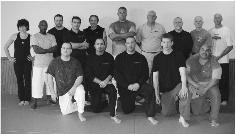
The Self Defense Company Instructor Certification (May 2008).

The purpose of The Self Defense Company is to continue to teach and train the FASTEST, most EFFECTIVE and EFFICIENT means self defense to anyone regardless of experience, size, man or woman. No one should one without the means and the resources to protect themselves and their loved ones from harm.