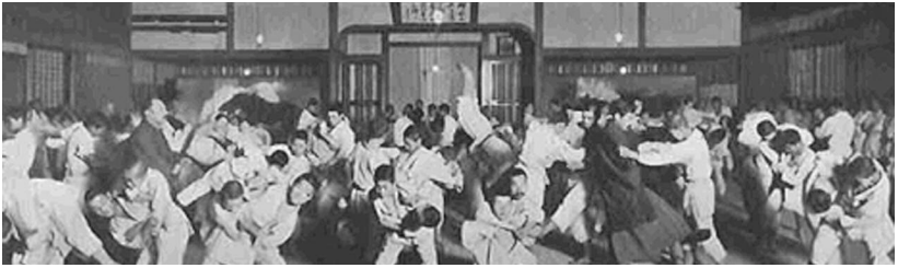
Standing Room Only - Judo practice at the Kodokan in Japan, circa 1920

Before the use of London Prize Ring rules and the Marquis of Queensbury, pugilists used a great number of different grappling, striking, kicking and gouging methods. Ancient Greek Pankration was a combined system of “all powers” combat and the first documented account of mixed-martial arts.